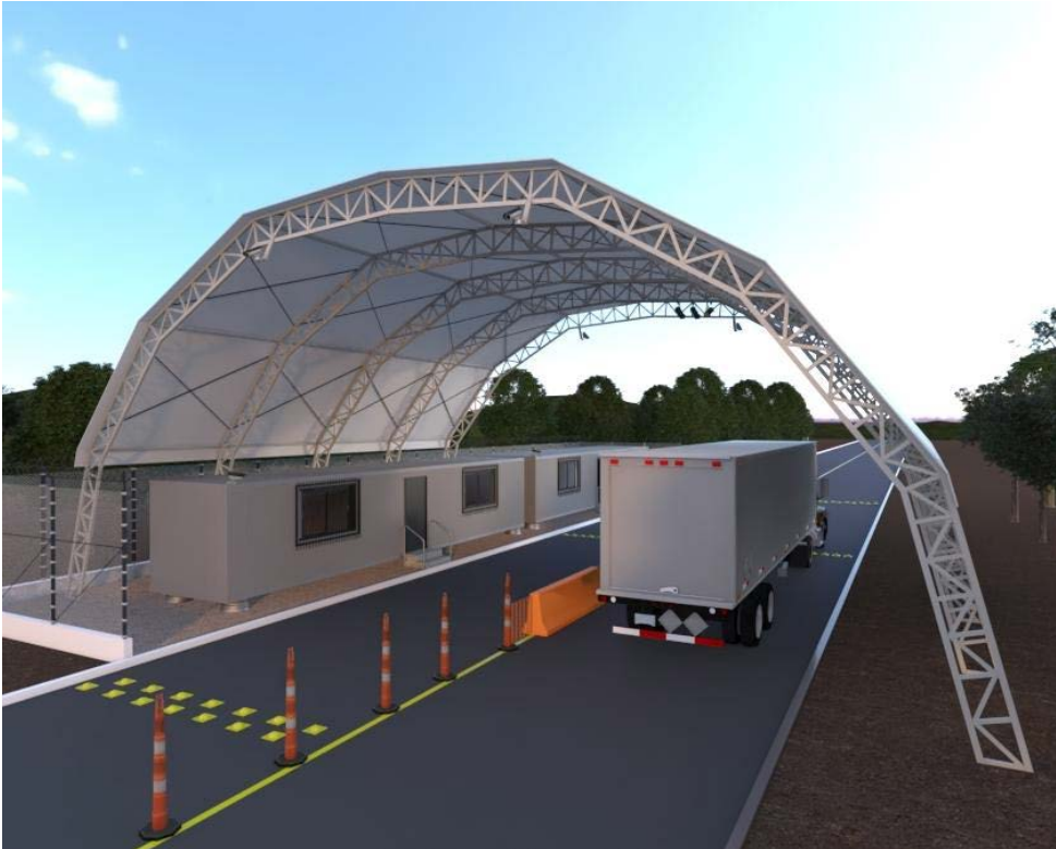
Figure 1. Design