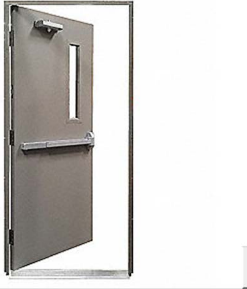
Figure 6. Container doors